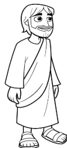
"Let your light shine." Matthew 5:16, NIV

Ask your child: 1. What do you like to eat for breakfast? 2. What do you think Jesus and the disciples ate for breakfast?